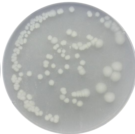
Escherichia coli ATCC 25922